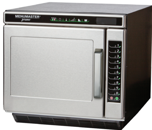
Model JET14V shown